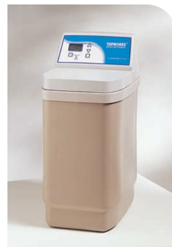
AD 11 Our most popular domestic softener