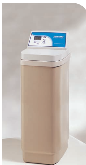
AD 15 A real powerhouse softener with the capacity to soften over 3000 litres per day