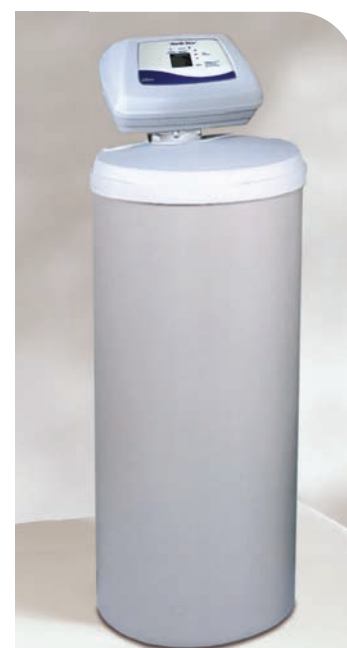
NSC40 UD1 High capacity softener suitable for larger households and commercial applications