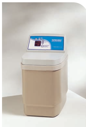
Ultra 9 Our most compact softener, easily concealed in a kitchen cupboard